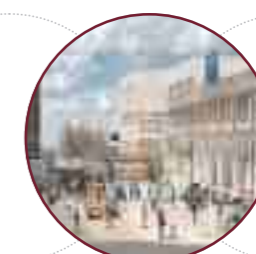
Chosen as Seoul Campus Town Construction Project