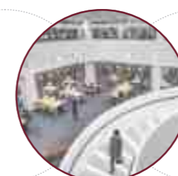
Central Library with advanced ICT technology