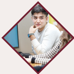
Chosen as SW-oriented University