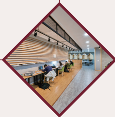
Central Library with advanced ICT technology