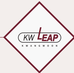
Chosen as Autonomous Contract University for the University Innovation Support Project.